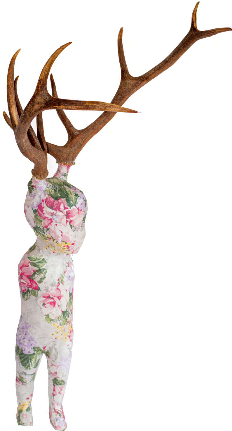
DDR Art Gallery Roberto López Avatar El Elegido Fiberglass and resin on canvas 150 x 30 cm 2016